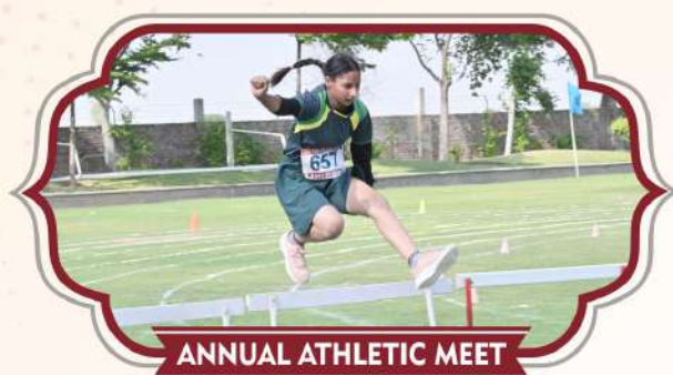
ANNUAL ATHLETIC MEET