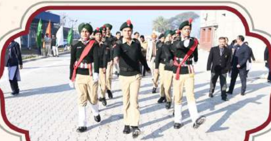
OUR NCC UNIT DURING PARADE