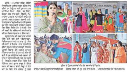
ਗੋਬਿੰਦ ਪਬਲਿਕ ਸਕੂਲ 'ਚ ਤੀਜੇ ਦਾ ਤਿਉਹਾਰ ਮਨਾਇਆ