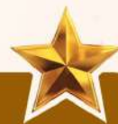
ANOOPJOT KAUR SIDHU GAME-KABADDI (U-19)