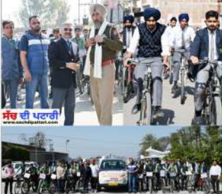
ਗੋਬਿੰਦ ਇੰਟਰਨੈਸ਼ਨਲ ਪਬਲਿਕ ਸਕੂਲ ਭਦੋਂਡ ਦੇ ਵਿਦਿਆਰਥੀਆਂ ਅਤੇ ਅਧਿਆਪਕਾਂ ਵਲੋਂ ਤੰਬਾਕੂ ਰਹਿਤ ਦਿਵਸ ਸਬੰਧੀ ਕੈਂਡੀ ਸਾਇਕਲ ਰੈਲੀ

ਭਦੋਂਡ, 16 ਮਾਰਚ (ਸੰਵਿਦਯਾ ਕਾਗਜ਼) - ਬਹਾਨਾ ਵਿਖੇ ਗੋਬਿੰਦ ਇੰਟਰਨੈਸ਼ਨਲ ਪਬਲਿਕ ਸਕੂਲ ਭਦੋਂਡ ਦੇ ਵਿਦਿਆਰਥੀਆਂ ਅਤੇ ਅਧਿਆਪਕਾਂ ਵਲੋਂ ਤੰਬਾਕੂ ਰਹਿਤ ਦਿਵਸ (ਟੈਬਾਕੂ-ਫਰੀ) ਸਮੇਤ ਹੋਰ ਸਮਾਜਿਕ ਕਾਰਜਾਂ ਲਈ ਸ਼ਾਮਲ ਹੋਣ ਲਈ ਇੱਕ ਰੈਲੀ ਦਾ ਆਯੋਜਨ ਕੀਤਾ ਗਿਆ। ਇਸ ਰੈਲੀ ਵਿੱਚ ਸਕੂਲ ਦੇ ਵਿਦਿਆਰਥੀਆਂ ਅਤੇ ਅਧਿਆਪਕਾਂ ਨੇ ਸ਼ਾਮਲ ਹੋ ਕੇ ਸਕੂਲ ਦੇ ਮੁਖ ਦਰਵਾਜ਼ੇ ਤੋਂ ਸ਼ੁਰੂ ਕਰਕੇ ਸ਼ਹਿਰ ਦੇ ਮੁਖ ਮਾਰਗ ਤੱਕ ਰੈਲੀ ਚਲਾਈ। ਇਸ ਰੈਲੀ ਵਿੱਚ ਸਕੂਲ ਦੇ ਵਿਦਿਆਰਥੀਆਂ ਅਤੇ ਅਧਿਆਪਕਾਂ ਨੇ ਸ਼ਾਮਲ ਹੋ ਕੇ ਸਕੂਲ ਦੇ ਮੁਖ ਦਰਵਾਜ਼ੇ ਤੋਂ ਸ਼ੁਰੂ ਕਰਕੇ ਸ਼ਹਿਰ ਦੇ ਮੁਖ ਮਾਰਗ ਤੱਕ ਰੈਲੀ ਚਲਾਈ। ਇਸ ਰੈਲੀ ਵਿੱਚ ਸਕੂਲ ਦੇ ਵਿਦਿਆਰਥੀਆਂ ਅਤੇ ਅਧਿਆਪਕਾਂ ਨੇ ਸ਼ਾਮਲ ਹੋ ਕੇ ਸਕੂਲ ਦੇ ਮੁਖ ਦਰਵਾਜ਼ੇ ਤੋਂ ਸ਼ੁਰੂ ਕਰਕੇ ਸ਼ਹਿਰ ਦੇ ਮੁਖ ਮਾਰਗ ਤੱਕ ਰੈਲੀ ਚਲਾਈ।