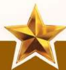
GAGANPREET KAUR DHALIWAL GAME-KABADDI (U-19)