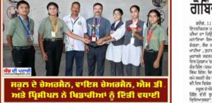
ਗੋਬਿੰਦ ਇੰਟਰਨੈਸ਼ਨਲ ਪਬਲਿਕ ਸਕੂਲ ਭਦੋਂਡ ਦੇ ਖਿਡਾਰੀਆਂ ਨੇ ਰਿਜ਼ਨਲ ਐਥਲੈਟਿਕਸ ਟੂਰਨਾਮੈਂਟ 'ਚ ਮਾਰੀਆਂ ਮੱਲਾਂ।

ਹਾਂ ਅਤੇ ਸਿਰਫ਼ ਇਕੱਠੇ ਹੀ ਨਹੀਂ ਸਗੋਂ ਸ਼ਹਿਰ ਦੇ ਹੋਰ ਹਿੱਸਿਆਂ ਵਿੱਚ ਵੀ ਆਪਣੇ ਸ਼ਾਹੀ ਪ੍ਰਦਰਸ਼ਨ ਪੇਸ਼ ਕੀਤੇ।