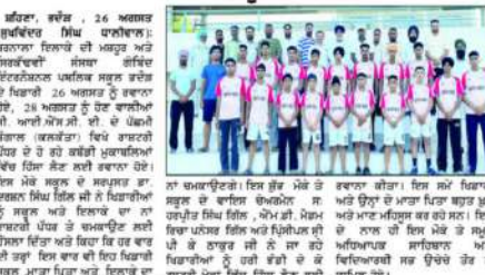
ਗੋਬਿੰਦ ਇੰਟਰਨੈਸ਼ਨਲ ਸਕੂਲ ਦੇ ਖਿਡਾਰੀ ਰਵਾਨਾ