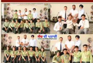
ਗੋਬਿੰਦ ਇੰਟਰਨੈਸ਼ਨਲ ਪਬਲਿਕ ਸਕੂਲ ਭਦੋਂਡ ਦੇ ਹੋਟਰਾ ਖਿਡਾਰੀਆਂ ਨੇ ਜ਼ੋਨਲ ਪੱਧਰ ਦੇ ਬਾਕਸਿਗ ਮੁਕਾਬਲਿਆਂ ਵਿੱਚ ਮਾਰੀਆਂ ਮੱਲਾਂ।

ਖਿਡਾਰੀਆਂ ਨੇ 12 ਗੋਲਡ 5 ਸਿਲਵਰ ਅਤੇ 3 ਬਰੌਨ ਮੈਡਲ ਜਿੱਤ ਕੇ ਸਕੂਲ ਦਾ ਨਾਮ ਰੌਸ਼ਨ ਕੀਤਾ