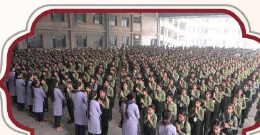
MORNING ASSEMBLY (SENIOR WING)