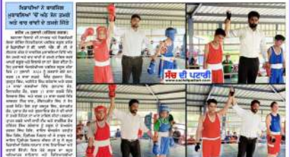
ਗੋਬਿੰਦ ਇੰਟਰਨੈਸ਼ਨਲ ਪਬਲਿਕ ਸਕੂਲ ਭਦੋਂਡ ਦੇ ਖਿਡਾਰੀਆਂ ਨੇ ਜ਼ੋਨਲ ਪੱਧਰ ਦੇ ਬਾਕਸਿਗ ਮੁਕਾਬਲਿਆਂ 'ਚ ਮਾਰੀਆਂ ਮੱਲਾਂ।