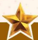
GURNOOR K. BRAR GAME-KABADDI (U-14)