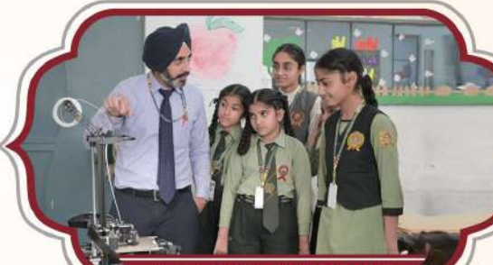
AI LAB (3D MACHINE)