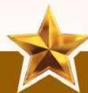
GURUP TESH SINGH GAME:-KABADDI (U-14)