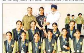
ਗੋਬਿੰਦ ਇੰਟਰਨੈਸ਼ਨਲ ਪਬਲਿਕ ਸਕੂਲ ਭਦੋਂਡ ਦੇ ਹੋਟਰਾ ਖਿਡਾਰੀਆਂ ਨੇ ਜ਼ੋਨਲ ਪੱਧਰ ਦੇ ਬਾਕਸਿਗ ਮੁਕਾਬਲਿਆਂ ਵਿੱਚ ਮਾਰੀਆਂ ਮੱਲਾਂ।

ਹਾਂ ਅਤੇ ਸਿਰਫ਼ ਇਕੱਠੇ ਹੀ ਨਹੀਂ ਸਗੋਂ ਸ਼ਹਿਰ ਦੇ ਹੋਰ ਹਿੱਸਿਆਂ ਵਿੱਚ ਵੀ ਆਪਣੇ ਸ਼ਾਹੀ ਪ੍ਰਦਰਸ਼ਨ ਪੇਸ਼ ਕੀਤੇ।